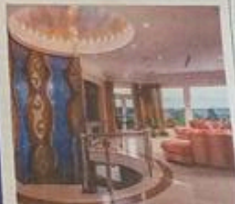
Every day will feel like vacation in a luxury tropical resort in this stunning Mt. Helix home.